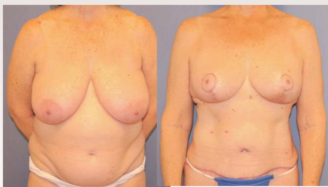
51 year old 3 months after a combined Breast Reduction and cosmetic Abdominoplasty