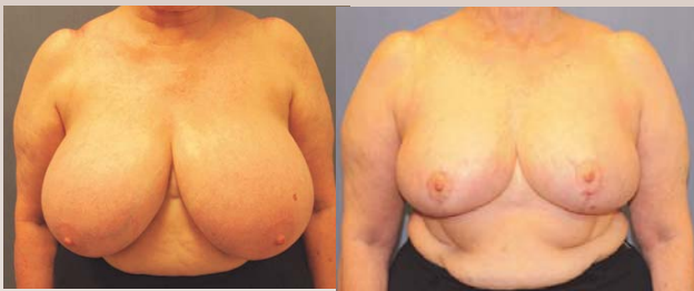
56 year old after 2000g breast reduction

The patient is seen again at 2 weeks, 3 months, 6 months and 1 year.